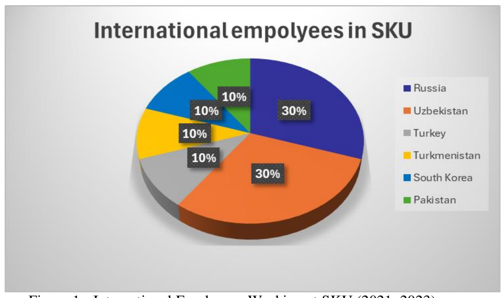
Figure 1 - International Employees Working at SKU (2021–2023)

Over the past three years, the number of foreign employees and teachers has amounted to 10 people.