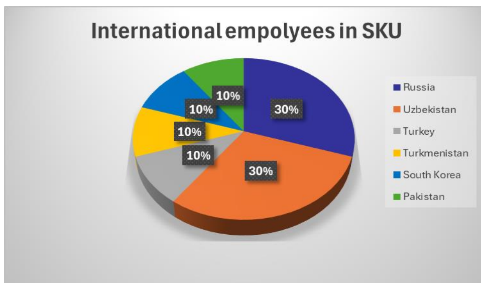
Figure 1 - International Employees Working at SKU (2021–2023)

Over the past three years, the number of foreign employees and teachers has amounted to 10 people.