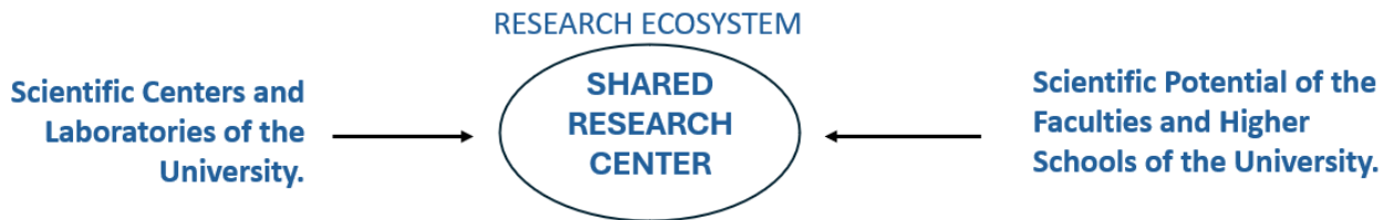
Figure 3 - Research ecosystem.

According to the Program’s concept, the main core of the innovative research ecosystem being created at the research university (Figure 3) will be the shared research center.