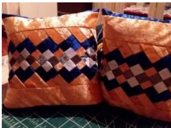
Fig. 6. Fig. 5. Design of pillows. Kurak №3 - 'Eye' (2 nd variant)

Kurak is a symbol of endurance, thrift, patience. Kurak is made with the intention to increase your wealth, livestock and soul. A mother adds a deep meaning and wishes to the creation of her daughter's kurak: 'My daughter, you have jumped over the white threshold - grow up, let go of the leaves, just move forward, there is no way back, do not come back - the door is closed. Life is like a ladder (Fig. 1, 2. №1), move forward, overcome difficulties - only then will the leaves spread, the field will expand. (Fig. 3, №6)