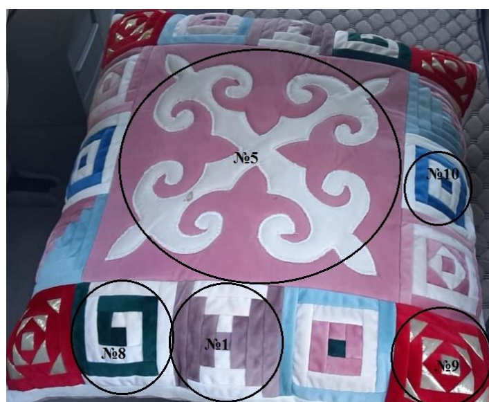
Fig. 2. Design of pillow. Kurak №1-‘Stairs’/ baspaldak, №5 - ‘ram's horn’ / koshkar muyiz, №8 – ‘labyrinth’, №9 – ‘star’ / zhuldyzsha, №10 – ‘well’ / kudyk