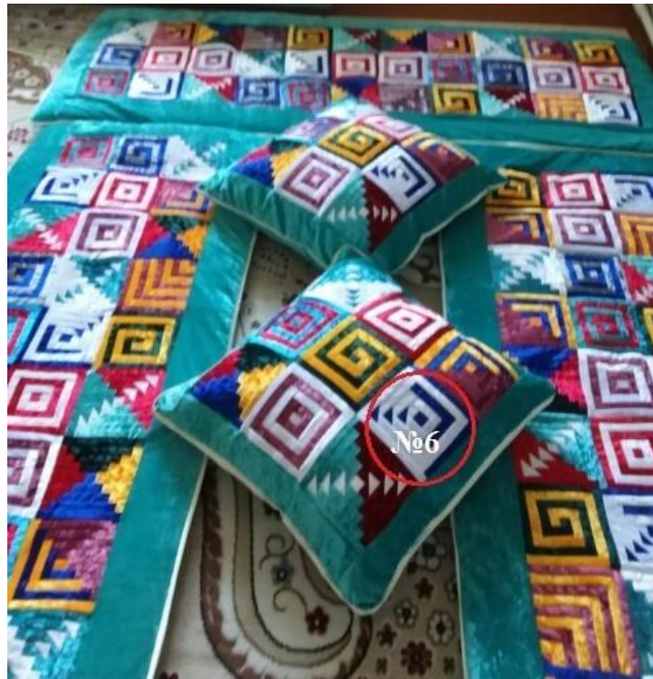
Fig. 3. Design of pillows and blankets. Kurak №1 -‘Stairs’/ baspaldak, №6 – ‘crane row’ – tyrna katar, №8 - ‘labyrinth’, №10 –‘well’ / kudyk