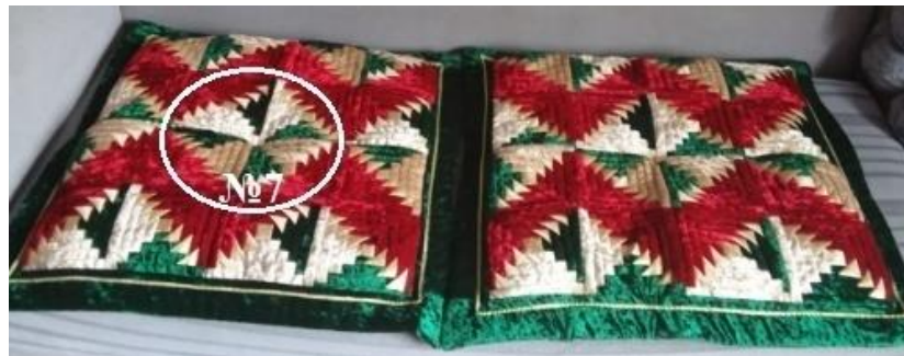
Fig. 4. Design of blankets. Kurak №7 –‘light dark’ / ak pen kara