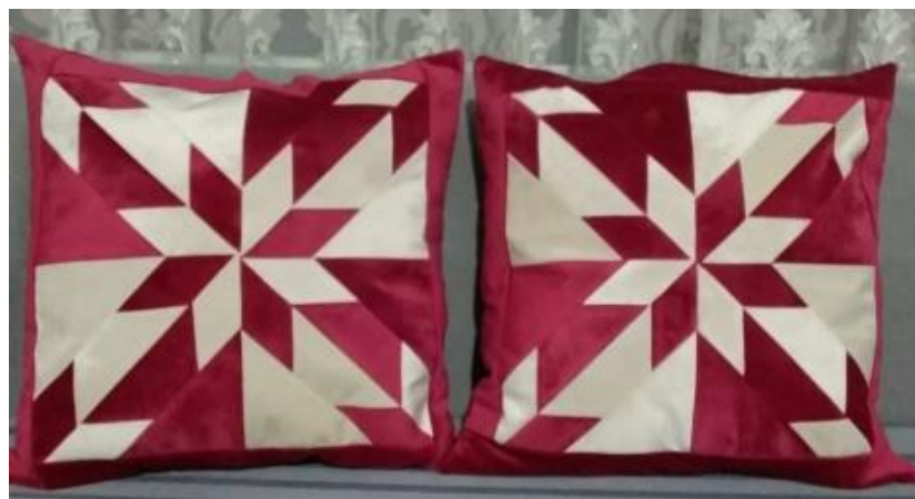
Fig. 5. Design of pillows. Kurak №9 - ‘star’. (2 nd variant)